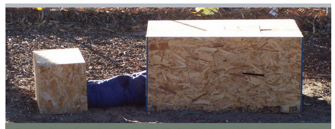
During passive apprehension leg training it is natural for the agitator to move prior to contact to absorb the impact. By having the agitator in a box specifically made where the feet and upper body cannot be contacted by the PSD the agitator can then remain passive by not moving due to not being able to see the PSD while only having the legs safely exposed.

when confronted by the PSD. These three areas should be included in scenario training and can be tweaked by adding objects and changing enviroments.