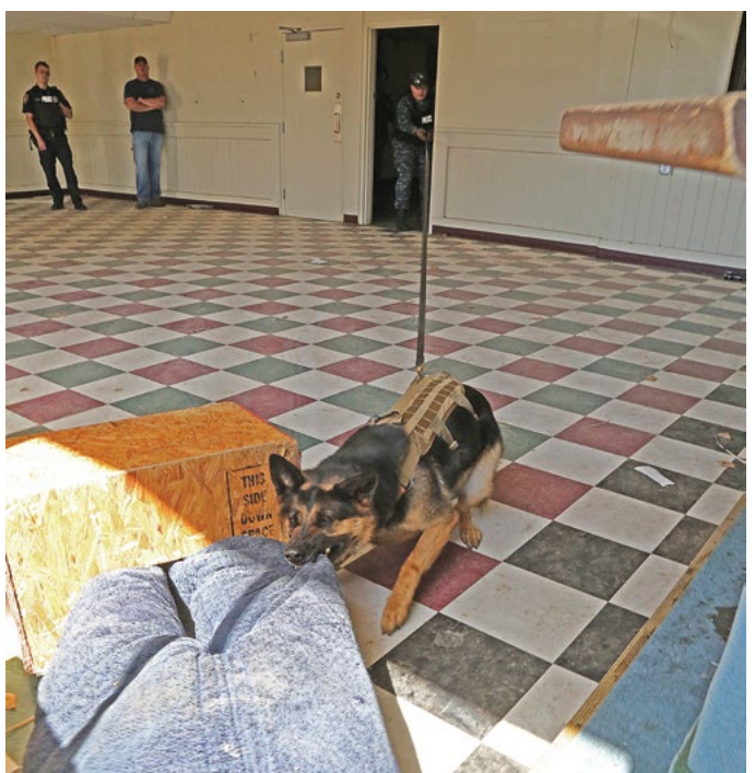
There are generally three things a suspect will be doing upon contact with the police service dog. He will either flee, fight or hide, and when the suspect is hiding, he is generally passive and not moving.